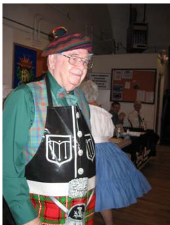
Lord of the Haggis